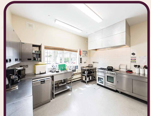
Kitchen with Natural Light