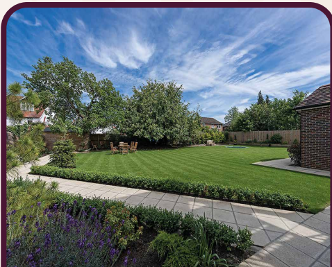
Beautiful Spacious Garden