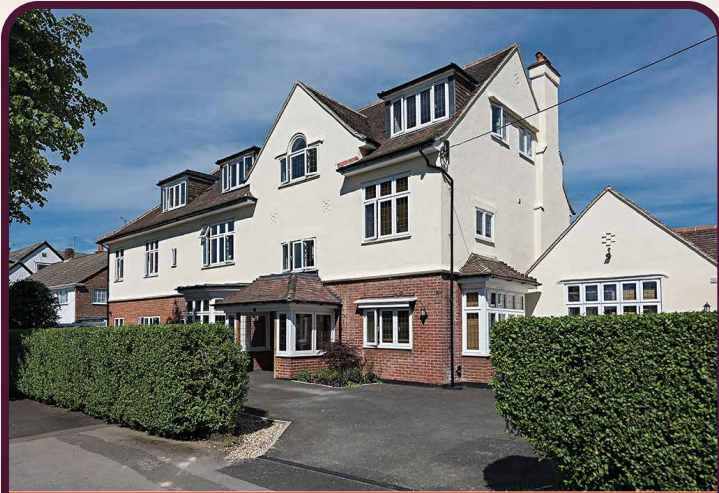
Outside Mayfield Road