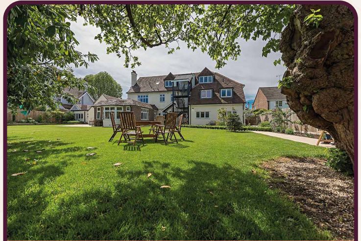
Spacious Garden with table and chairs