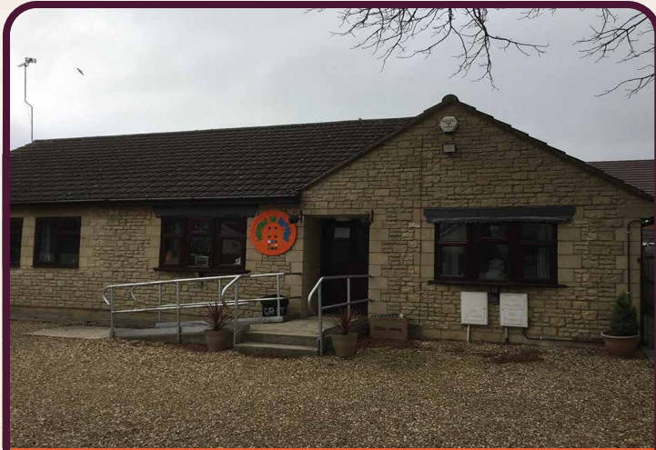
Front view of Buttons