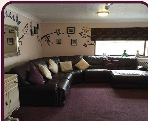
Communal living space