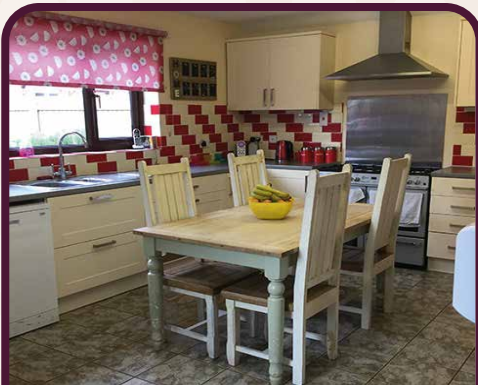
Communal dining/kitchen area