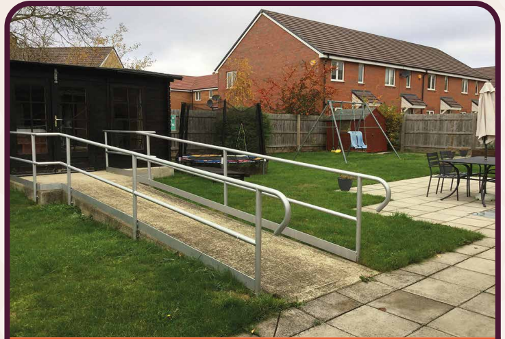
Spacious Garden with a Swing and Trampoline