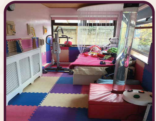
Sensory Light and Soft room